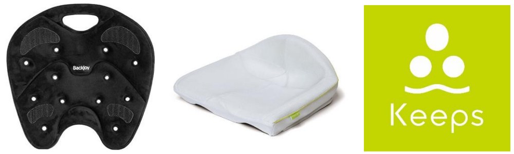
L to R: Backjoy Orthopedic Back Support and Nishikawa Keeps Hip Pillow Cushion

3. Look forward to its renewed Healthcare Corner, where beauty and wellness enthusiasts are welcome to try out various healthcare products before making a purchase. This includes Backjoy Orthopedic Back Support and Orchard Central store-exclusive Nishikawa Keeps Hip Pillow Cushion for better spine alignment when you are seated.