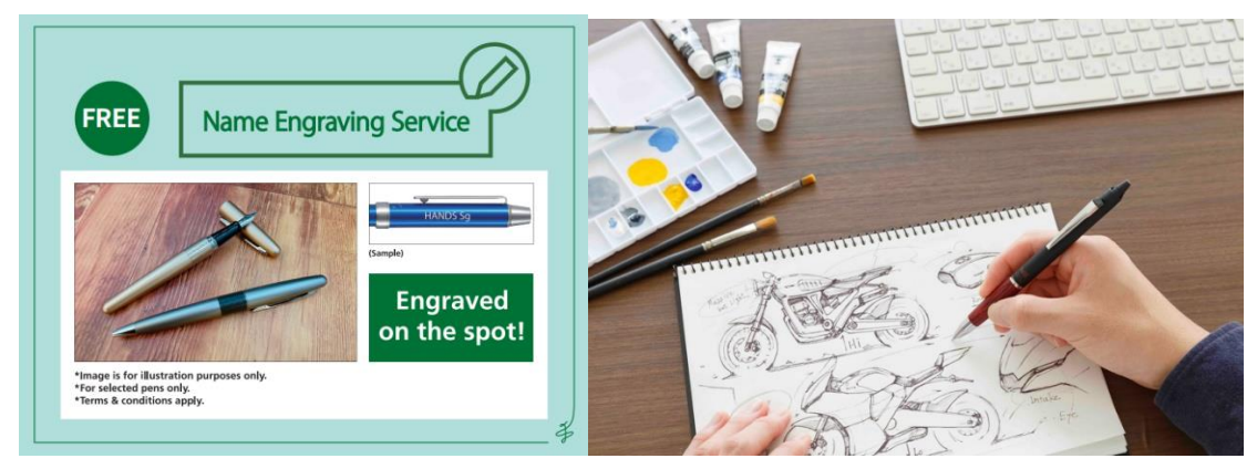
Pilot Frixion Ball Knock Zone pens- exclusive pre-launch in Hands Singapore stores

Discover the new collection of the full line-up of Pilot MR3 series of fountain pens, roller ball and ballpoint pens, the new "Yubi-Makie" from Sailor Fountain Pen and many more. Each purchase comes with HANDS's complimentary personalized Name Engraving Service Shoppers can surprise their loved ones with this added personalization to the gift.