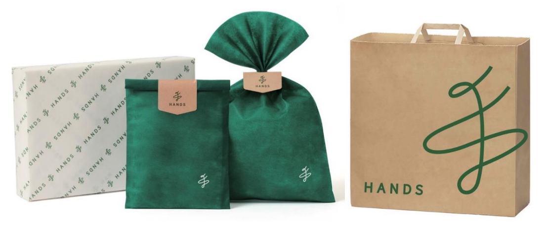
HANDS' new wrapping paper, non-woven bag, and paper shopping bag

Look forward to the renewed gift-wrapping service. Present the perfect gift in a new wrapping design where you can wrap your purchased items neatly in various shapes and/or sizes for a nice presentation, while including a hand-written customized message on the top. It comes with a non-woven bag and an environmentally friendly paper closure and seal.